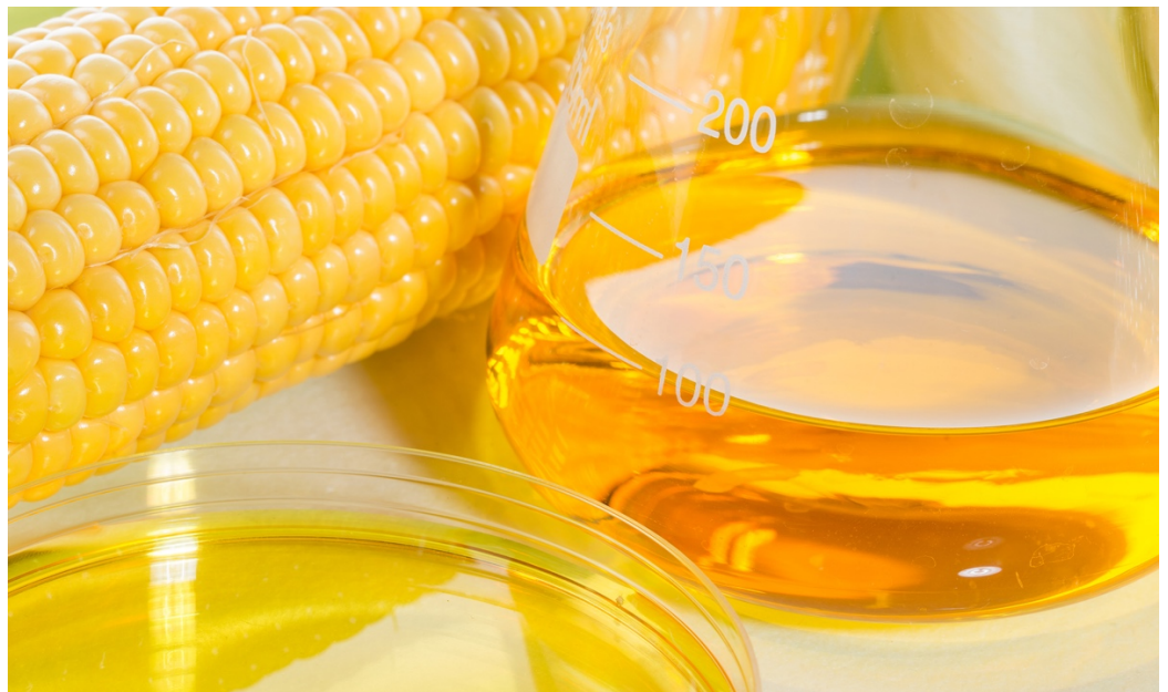
Figure 4. Corn syrup is being used as an ingredient for baking. To produce corn syrup, the starch is broken down into sugar by amylase enzymes. This enzymatic process has completely replaced the older chemical process that used acid and heat to break down the starch. The advantages of the enzymatic process include reduced energy and chemical consumption as well as better yield.

Alpha-amylases are widely used enzymes across many different applications, including making starch fermentable for grain alcohol production and beer brewing, producing corn syrup, treating food starch to achieve textures not possible with untreated starch, improving bread quality, and replacing phosphates in dishwashing detergents.