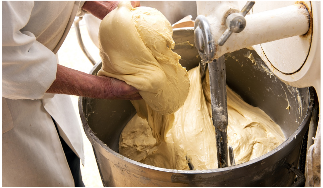
Figure 5. A baker handling dough. As one of the many enzymes used in baking, lipases are added to improve dough handling by e.g. making the dough more elastic and less sticky.

One particularly efficient lipase is found in an organism called Fusarium heterosporum , an ascomycete filamentous fungus from the large genus Fusarium . Most members are soil-dwelling fungi, while others are plant pathogens that can produce mycotoxins. Some can also cause opportunistic infections in humans. Hansenula polymorpha (also called Ogataea polymorpha ) is a yeast that is related to baker's yeast and is a safe industrial production host for enzymes. By transferring the F. heterosporum gene into H. polymorpha , the enzyme can be manufactured at large scale without the potential hazards of cultivating F. heterosporum itself.