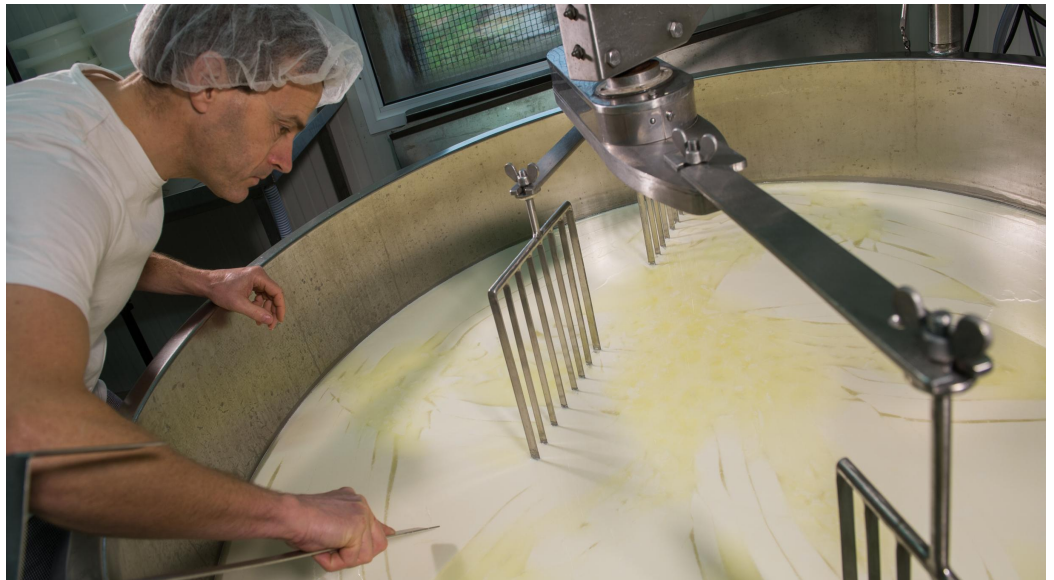
Figure 3. A cheesemaker cuts the curd that has formed after rennet was added to milk during cheese production. “Vegetarian rennet”, or recombinant chymosin, is produced through a process identical to that used in cellular agriculture. Chymosin was one of the first commercial products made using this method, beginning nearly 30 years ago.

The primary active component of the enzyme complex rennet is a protein called Chymosin B, a protease naturally found in the lining of calf stomachs. Its biological function is to cleave the milk protein casein at a specific site, causing the milk protein to curdle (separate into clumps) and thereby enabling better protein absorption by the calf. Historically, the stomachs of slaughtered unweaned calves were scraped out to obtain these milk-curdling enzymes in the form of rennet paste, which was then used to curdle milk in an early step of cheese production. Since rennet is both limited in supply and makes cheese unsuitable for vegetarians, various alternatives from plants and microbes were developed. These alternatives, however, all exhibited downsides such as bitter taste. The first fermentation-produced Chymosin B was approved by the FDA in the US in 1990. Being the exact same enzyme as in calf rennet, it did not show the disadvantages seen in vegetable or microbial rennet. By 1999, already 60% of US hard cheeses were made with fermentation-produced rennet 17 . Nowadays, 80% of the rennet used worldwide is produced by fermentation 18 .